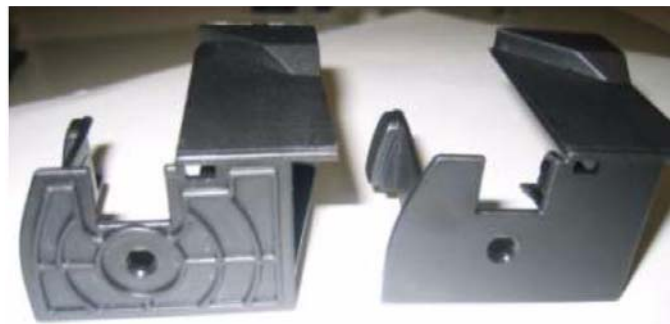
New reinforced clasp

The plastic clasps are available under the following spare-part numbers: 543597 (left) and 543596 (right).