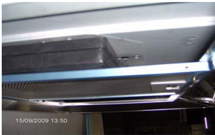
Fig. 1: Installation situation with a charcoal filter model ZUB 612

When using the charcoal filter ZUB 612 (spare-part no. 538022) in the cooker hoods shown above, the construction form of the charcoal filter may cause problems when absorbing vapours in the recirculation air mode (see Figure 1).