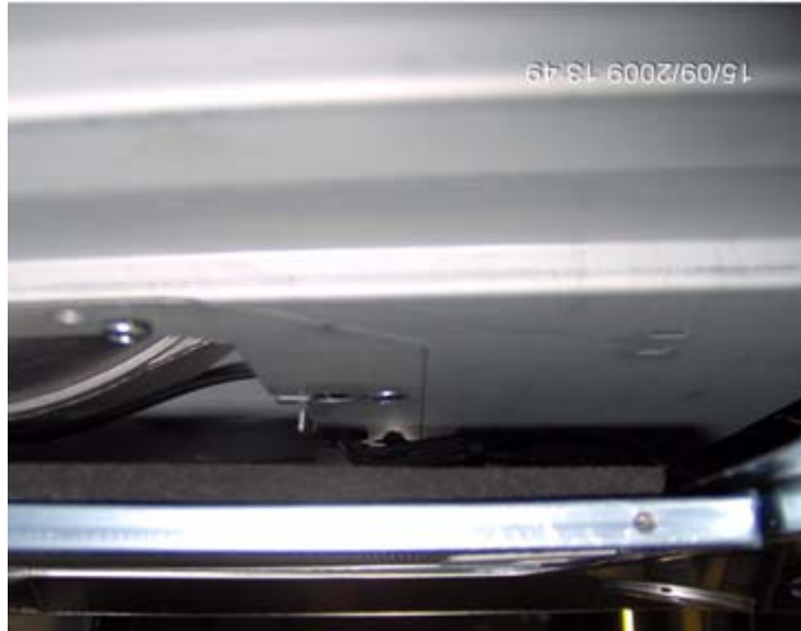
Fig. 3: Installation situation after installation of the new grease filter with the charcoal filter mat

Individual fastening clamps are not available.