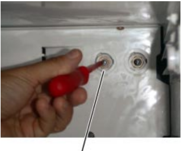
Turn counter clockwise

Put the caps back on and carry out a function test.