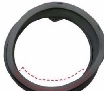
b) The area of the door seal which is mostly damaged.