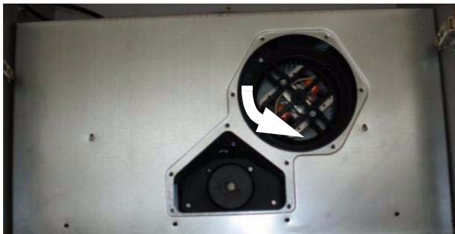
Figure 4: Remove motor base