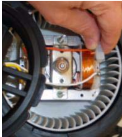
Figure 7: Remove plastic cover