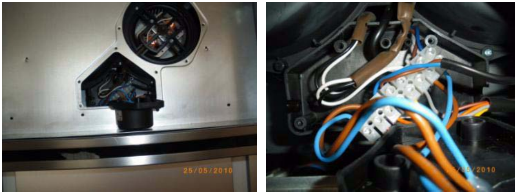
Figure 3: Release motor wires