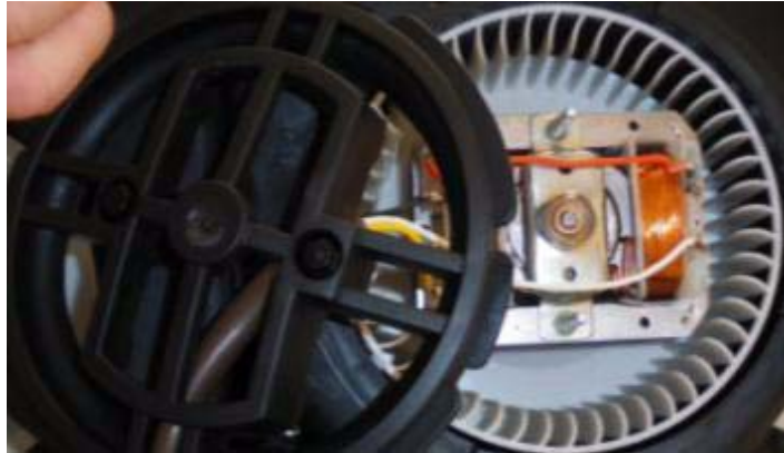
Figure 6: Remove the motor base