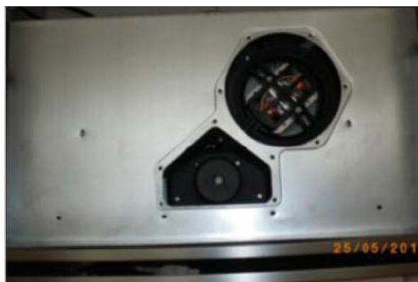
Figure 2: Hood motor

Remove the hood from the kitchen furniture. Remove the motor plate cover.