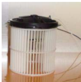
Figure 5: Hood motor