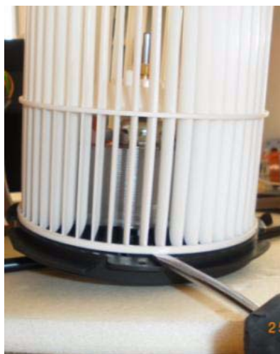
Figure 8: Make sure there is not turbine vs motor base interference before placing it back.